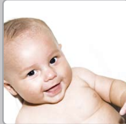
Cord Blood Stem Cells