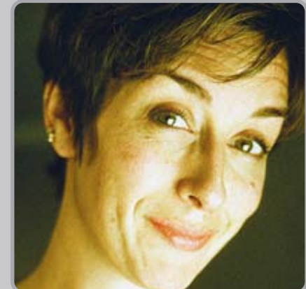
Adult Stem Cells